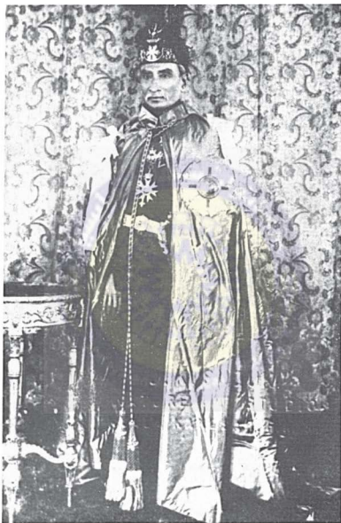
H.R.H. Sultan Idris, 28th Sultan of Perak.