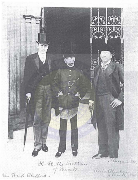
H.R.H. Sultan Idris in London with Mr. Hugh Clifford and Raja Chulan bin Sultan Abdullah outside Buckingham Palace, 1902.